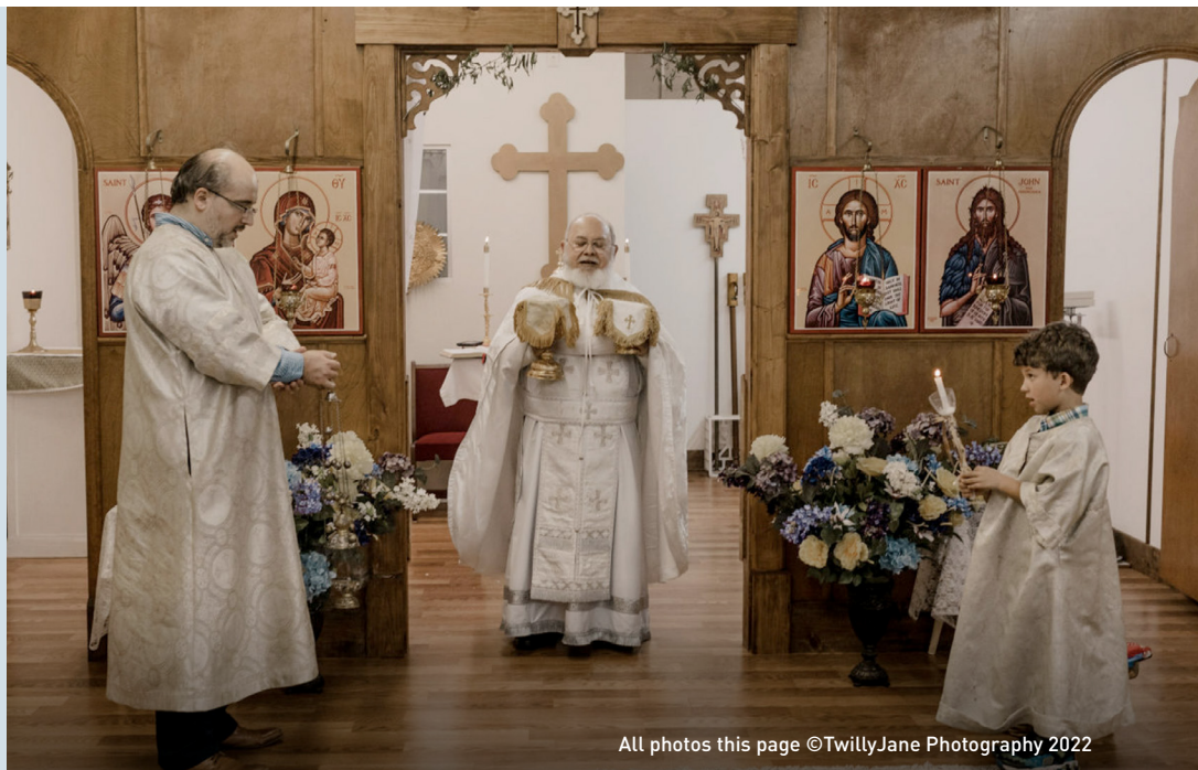
All photos this page ©TwillyJane Photography 2022