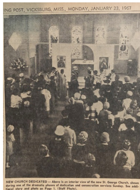
NEW CHURCH DEDICATED — Above is an interior view of the new St. George Church, shown during one of the dramatic phases of dedication and consecration services Sunday. See additional story and photo on Page 1.